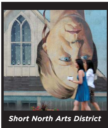
Short North Arts District

Downtown Columbus is surrounded by entertainment districts, filled with shopping, dining and other attractions. The Arena District is home to many restaurants, nightclubs and a plush movie theater. In the neighboring Short North Arts District , you'll find restaurants, galleries, boutiques and nightclubs. South of downtown are German Village , a restored historic district with charming homes and shops, and the Brewery District , with the nation's largest theater troupe, Shadowbox Live.